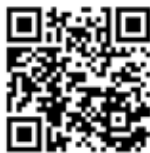
Scan the QR code to go directly to the Outage Center

For more information, tips and to view the Outage Map, access the Outage Center on our website at www.ecirec.coop .